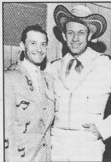
→ After an appearance on WSM with Hawkshaw Hawkins shortly before Hawks fatal plane crash.